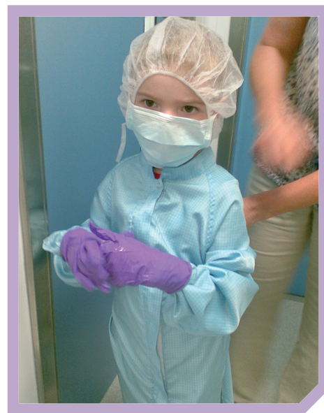
Figure 2: From a story book made for a five-year-old boy following his treatment on PICU after bowel surgery, showing his visit to the laboratory where his artificial feed was made

There are, however, many challenges relating to carrying out research with this population. As, by definition, children on PICU are critically ill, it is usually not